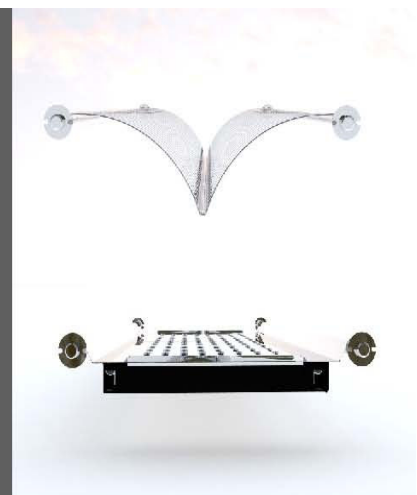
[** internomobile ] [interasse ]